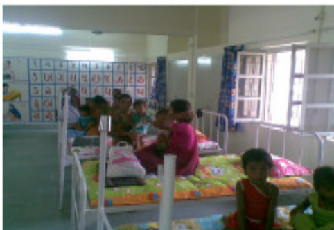
Malnourished children at "Bal Sewa Kendra"