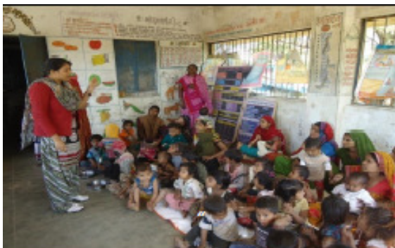
"Counseling session of mothers in VCNC"