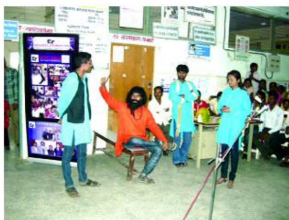
Epilepsy Camp Awareness Program through Street Play