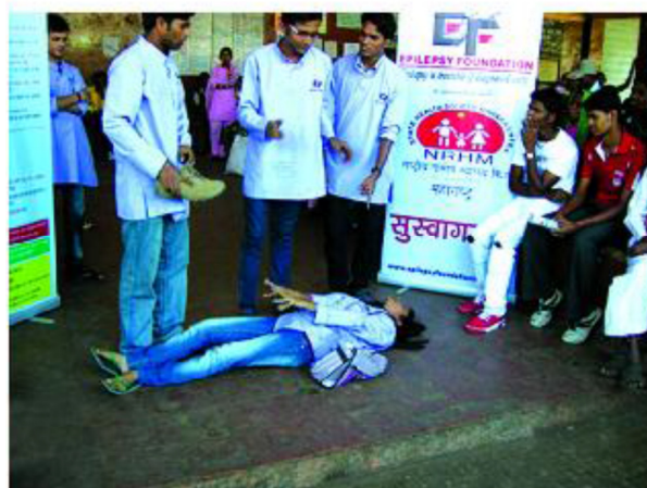
Epilepsy Camp Awareness Program through Street Play