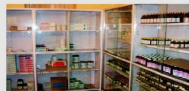
Rat proof medicine cabinet at Pune DH