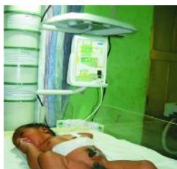
DH Thane, Maharashtra

42 SNCUs across Maharashtra are being strengthened by IPHS, Maharashtra.