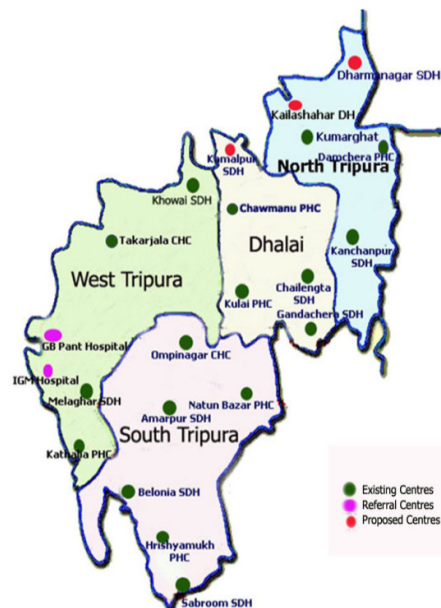
Map of Tripura showing the locations of Health Institutions and Referral Centres having Tele Medicine facilities

Deployment of Telemedicine facilities in different Government Hospitals (District Hospitals, Sub Divisional Hospitals and Community Health Centers / Primary Health Centers) in phases to improve accessibility and affordability to quality of specialist health care particularly to the poor and under-served population by use of Communication and Information Technology when distance separates the patients and the doctors.