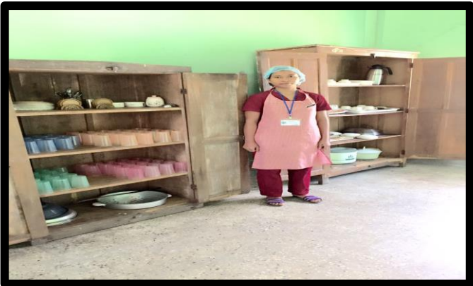
Work place Management: Kitchen