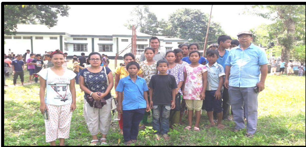
Medical Officer with Rongmigre SSA School Students & Teachers