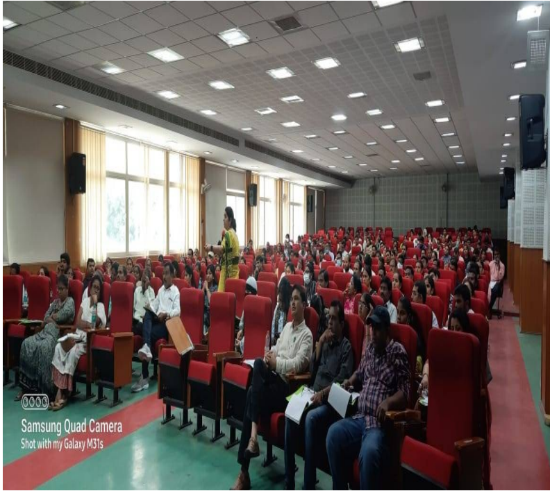
Faculty in National Health Mission Telangana Govt 's training program for 300 Medical Officers from Public Hospitals, on NQAS and LaQshya Implementation.