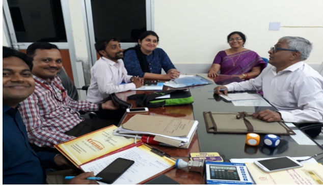
Participatory Handholding mentoring visits with the Medical Superintendent, Departmental HODs in District Hospital Khandhamal, NHM Odisha