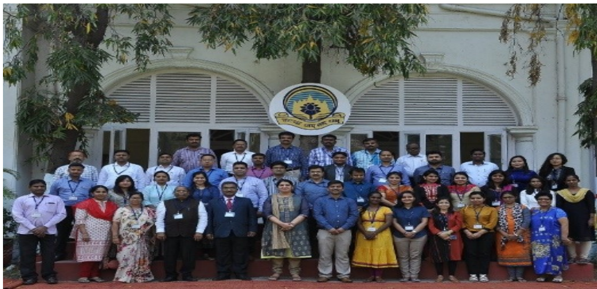
State Health Quality Teams from different states in ASCI in MDP National Quality Assurance Standards, sponsored by NHSRC in ASCI