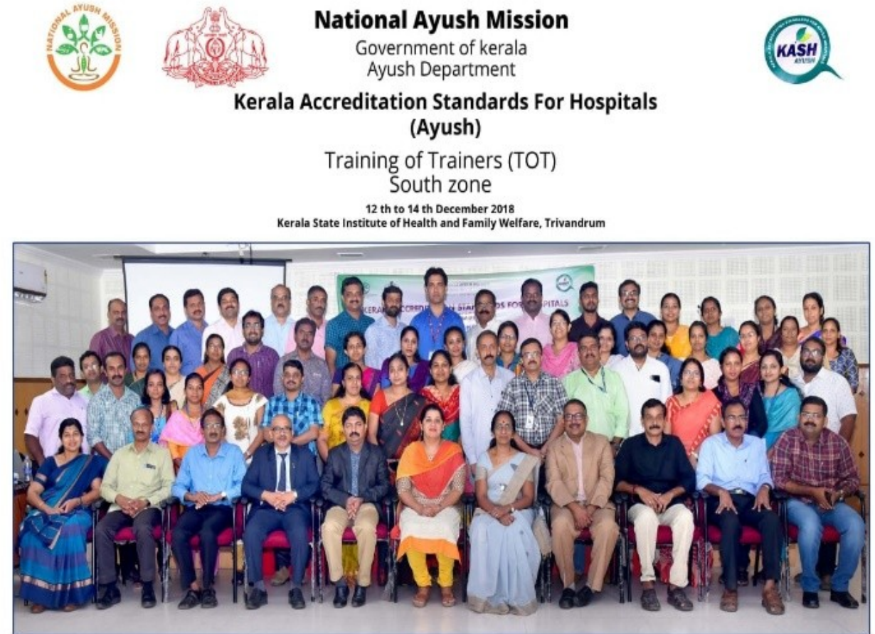
Participated as Chief Faculty in TOT and External Assessor training for Kerala State Govt - Accreditation Quality Standards for Hospitals, National AYUSH Mission