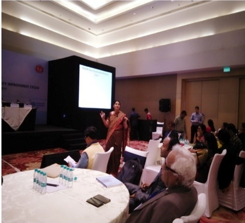
Speaker in LaQshya TOT in Bhopal, organized by LaQshya PMU, Ministry of Health, GOI and WHO